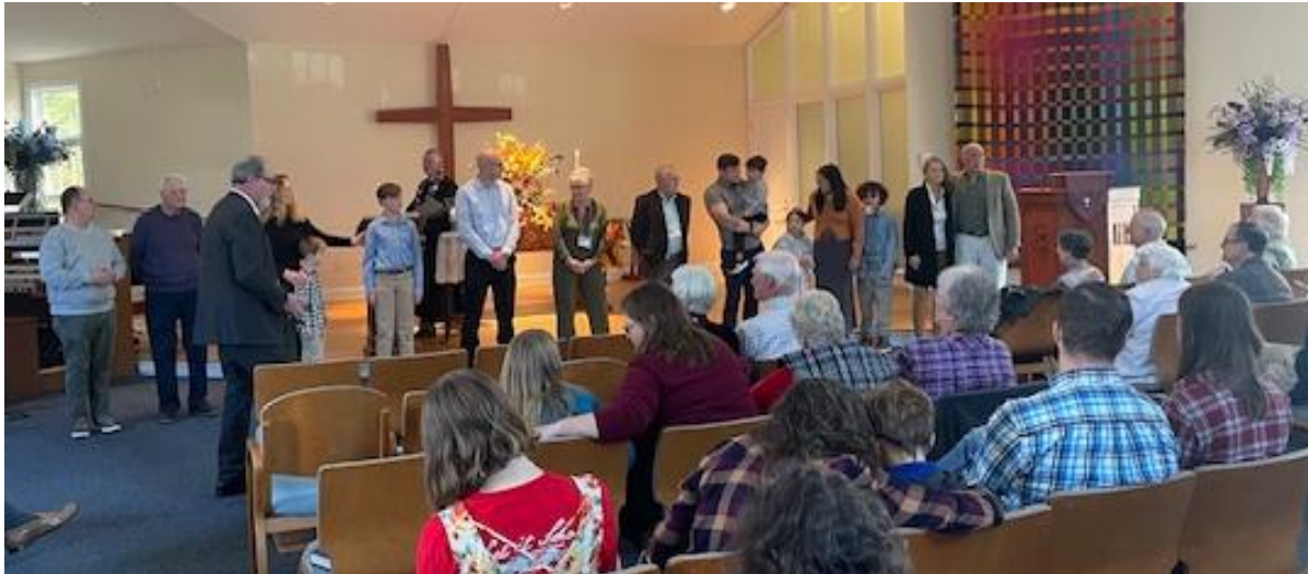
One Sunday ... 10 new members